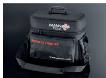
Shoulder bag PAMAS GO

The custom-fit shoulder bag provides extra space for accessories.