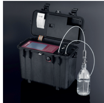
Rugged Case PAMAS S40 GO AVTUR

The PAMAS S40 AVTUR is optionally available in the robust PAMAS GO housing.