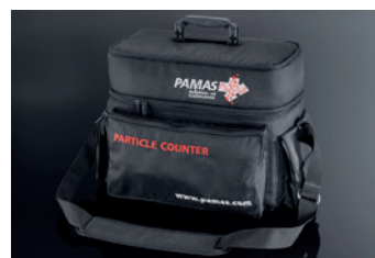
Schultertasche PAMAS GO

The custom-fit shoulder bag provides extra space for accessories.