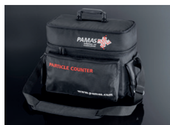
Shoulder bag PAMAS GO

The custom-fit shoulder bag provides extra space for accessories.