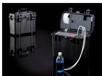
Rugged case PAMAS GO

All versions are optionally available in the robust PAMAS GO housing.