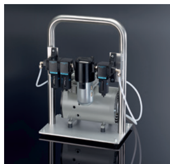
External pump with filter and air dryer unit for pressure and vacuum