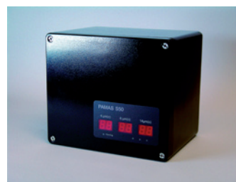
PAMAS S50P with integrated pump for pressureless applications

If the application supplies pressure, the unit can be operated without internal pump. PAMAS S50 continuously determines the flow rate through the sensor to achieve precise measuring results independent of the input pressure. The variable flow rate ranges between 5 and 50 ml/min. For pressureless applications, PAMAS S50 can be equipped with an additional pump ( PAMAS S50 P ). The wear resistant ceramic piston pump controls the flow rate to 25 ml/min at a pressure range from 0 to 7 bar.