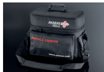
Schultertasche PAMAS GO

The custom-fit shoulder bag provides extra space for accessories.